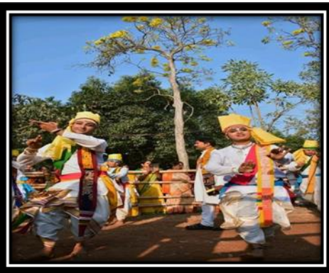
Fig.-16: Basanta Utsav at Santiniketan in 2023