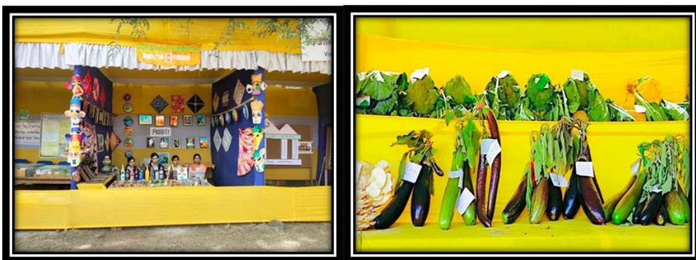
Fig.-12: Magh Mela at Sriniketan 2024

Magh Mela or Sriniketan Utsav (6-8 February): It was started first in the year 1328, 23 rd Magh (Visva-Bharati, Events Gallery). In every year this fair is organized on 6to 8 th of February. Agricultural exhibition is the main attraction of this fair. In this place the farmers from various villages bring their cultivated crops to exhibit their production. The fair is such a kind of place where people get a chance to intermingle with different cultures. By organization of this fair there is a chance for enculturation. Fair acts as a tool for economic and cultural development. This fair provides golden chance to sell handicrafts.