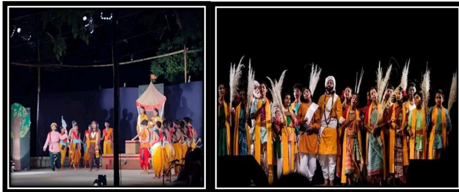
Fig.-5: Sarodotsava at Natya Ghar, October 2023

organizing the whole programme students can enhance their analytical skills and they can make a nexus with nature. Students can enrich and enlarge their innovative minds by collaborative cooperative skills. Apart from that, learners of Visva -Bharati can get the chance to test the nectar of the thoughts of Gurudev by performing and watching dramas which are composed by not only Tagore but also other literary personalities.