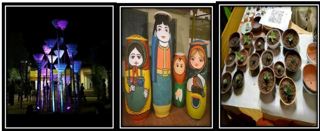
Fig.-8: Rathindra Mela (27 th November, 2023)

Rathindra Mela (27 th November) & Nandan Mela (1-2 December): There are two separate fairs, organized to commemorate two great personalities one is 'kabi putra' Rathindranath Tagore and other one is great artist Nandalal Bose. These two fairs are organized at Silpa Sadana and Kala Bhavana respectively. On the occasion of Rathindranath's birth anniversary, the students of Silpasadan celebrate it in Sriniketan by giving stall of their handmade artistic products and foods to give utmost respect to the contribution of Rathindranath Tagore. Similarly the students of Kalabhavan exhibit their art and sell it at affordable price before the day of birth anniversary of Nandalal Bose to bow down at the feet of the great artist Nandalal Bose. Students of Kalabhavan get a chance to showcase their creativity, artistic-expression, experiments by making different form of creation, and establish their own uniqueness in the sphere of art and culture. Modern education started giving emphasis to incorporate the art education in their curriculum whereas the organization of Nandan Mela has already given opportunities to the students to execute their cultural enrichment.