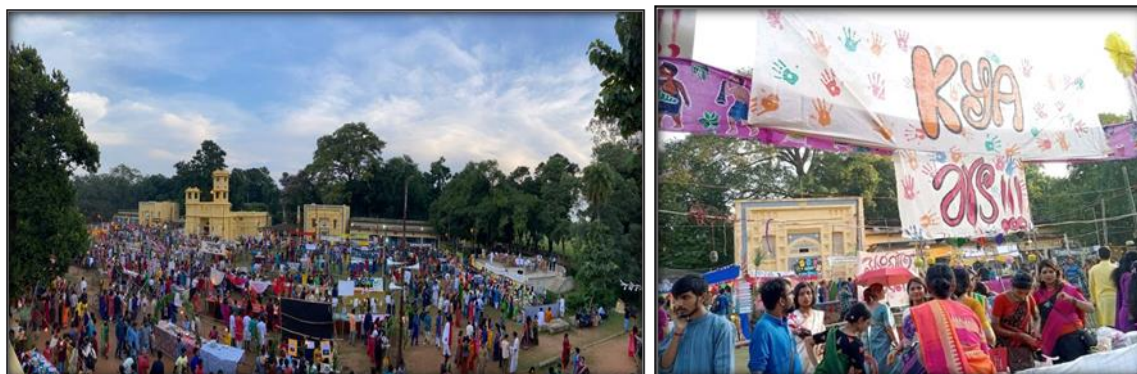
Fig.-6: Anandabazar at Gour Prangana, (14 th October, 2023)

Ananda Bazar: The name, 'Ananda Bazar' itself carries its meaning and it is formerly known as Ananda Mela. That means a Bazar with full of joy. On the day of Mahalaya the students, teachers and staffs arrange a bazar at Gour Prangana every year from 3pm to 8pm. Students of various departments make their own stalls to sell different kinds of foods, handicrafts made by their own hand. The Bazar can reach its zenith through assimilation of local people, students, teachers, and staffs. The most important thing is that the whole profit is contributed to the fund for charity.