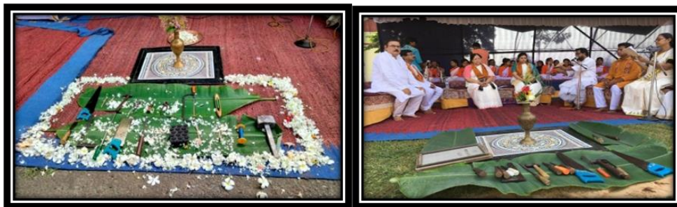
Fig.-4: Silpotsava at Sriniketan, Visva-Bharati