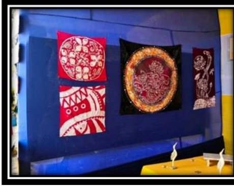
Fig.-14: Handicraft Exhibition (Siksha-Satra,Visva-Bharati)