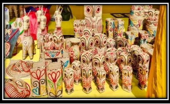
Fig.-15: Stalls at Magh Mela, 2024

Basanta Utsav: Spring has a special flavor in everyone's mind. It comes to rejuvenate nature after the dry winter. Rabindranath Tagore composed several songs, dramas, to feel the flavor of spring. It was Shamindranath who first celebrated spring at Santiniketan in 1907. Later Basanta Utsav was celebrated at Amrakunja and it was the initiation of this festival. Santiniketan wears a majestic outlook during Basanta Utsav. The songs, poems, dramas which are performed on this auspicious day, these are particularly illustrate the beauty of spring .Pupils can recognize the way spring rejuvenates mother earth. Several quintessential theories and information related to the science of the environment are embedded with the colours of Basanta Utsav. Students can be enriched by several pieces of information through this festival like the song 'dokhin hawa jago jago' asserts the wind direction in this season, south. We can be accelerated by Tagore's creative thoughts by the grace of seasonal festivals in Santiniketan.