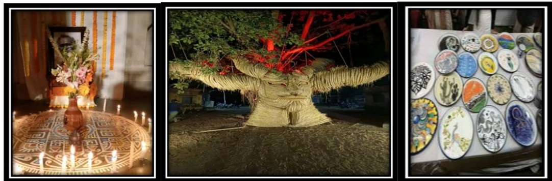
Fig.-9: Nandan Mela (1-2 December, 2023)