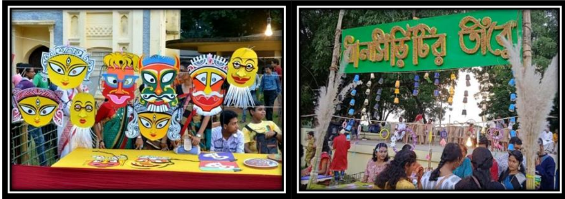
Fig.-7: Departmental stalls at Anandabazar

Rathindra Mela (27 th November) & Nandan Mela (1-2 December): There are two separate fairs, organized to commemorate two great personalities one is 'kabi putra' Rathindranath Tagore and other one is great artist Nandalal Bose. These two fairs are organized at Silpa Sadana and Kala Bhavana respectively. On the occasion of Rathindranath's birth anniversary, the students of Silpasadan celebrate it in Sriniketan by giving stall of their handmade artistic products and foods to give utmost respect to the contribution of Rathindranath Tagore. Similarly the students of Kalabhavan exhibit their art and sell it at affordable price before the day of birth anniversary of Nandalal Bose to bow down at the feet of the great artist Nandalal Bose. Students of Kalabhavan get a chance to showcase their creativity, artistic-expression, experiments by making different form of creation, and establish their own uniqueness in the sphere of art and culture. Modern education started giving emphasis to incorporate the art education in their curriculum whereas the organization of Nandan Mela has already given opportunities to the students to execute their cultural enrichment.