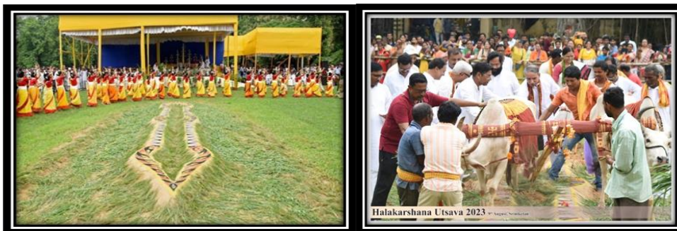
Fig.-2: Halakarshan at Sriniketan (9 th August, 2023)