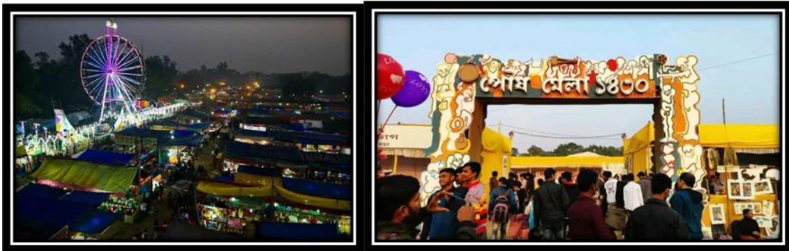
Fig.-10: Poush Mela in 2023

Poush Mela (7- 9th Poush): To commemorate the initiation occasion of Debendranath Tagore to brahma, the Poush fair is celebrated each year from 7 th poush to 9 th poush. It dates back to 1892 (Visva-Bharati, Events Gallery), when the fair was held on the ground located to the north of Brhman Mandir. It is a festival of joy.