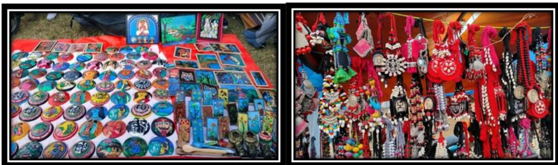
Fig.-11: Pop- up stalls at Poush Mela, 2023

Poushmela carries vibrant cultural integration where all communities transcend their boundaries to join to embrace the fair of joy. Regional culture, like Baul, Chhau dance, Kirton, Santali, Fakir gan, etc. all are arranged to intermingle with the diverse culture of our Bengal. Local sellers can get a chance to contribute to socio- economic advancement by selling their products in different stalls at this fair.